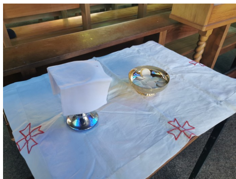
... Gifts we offer