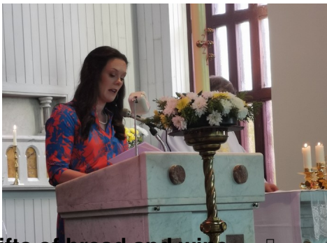
Gifts of bread and wine . . .