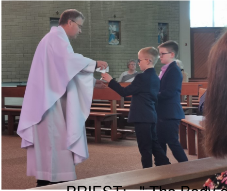
PRIEST: " The Body of Christ!"