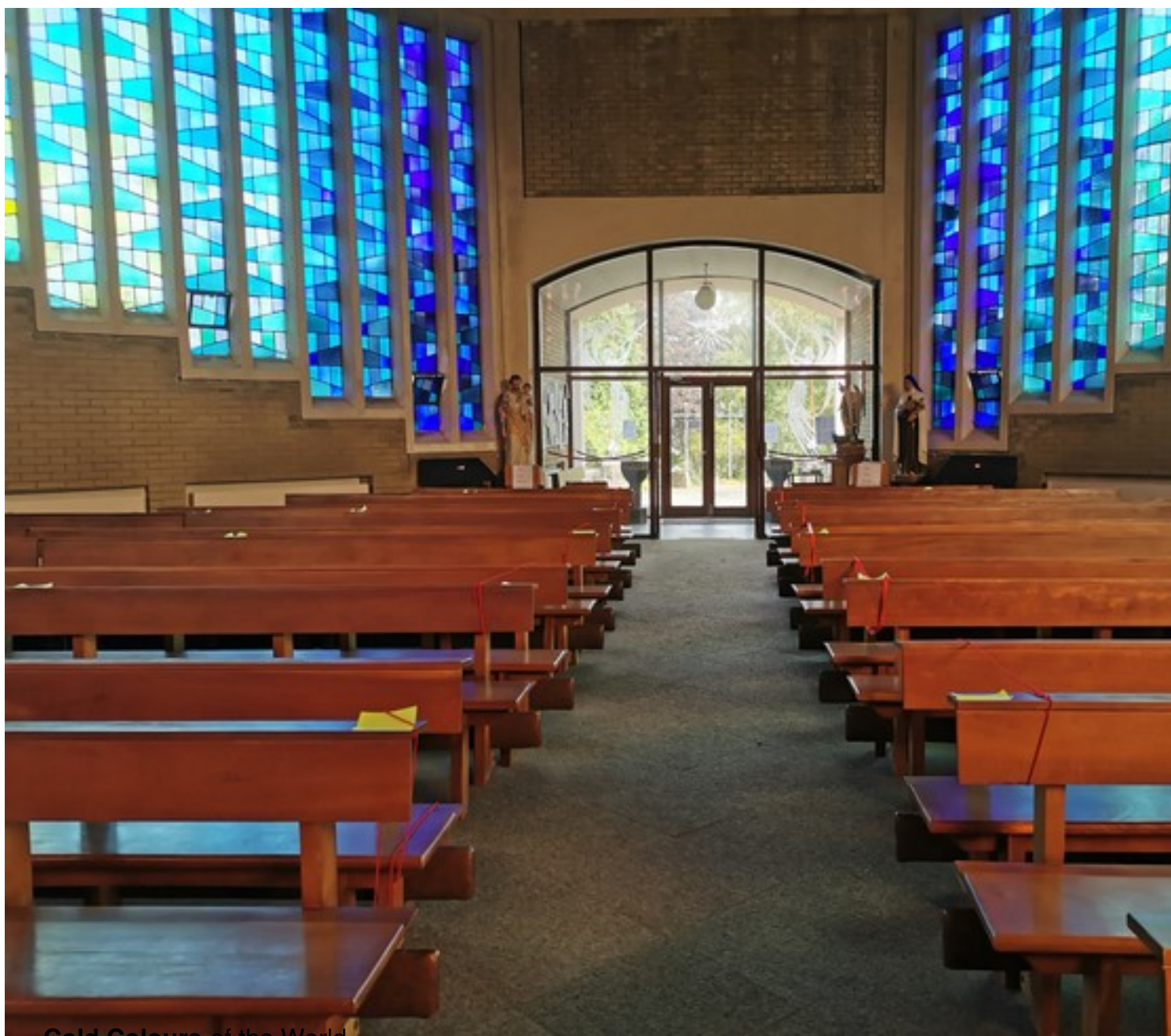
Cold Colours of the World -