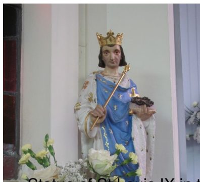
Statue of St Louis IX in the church