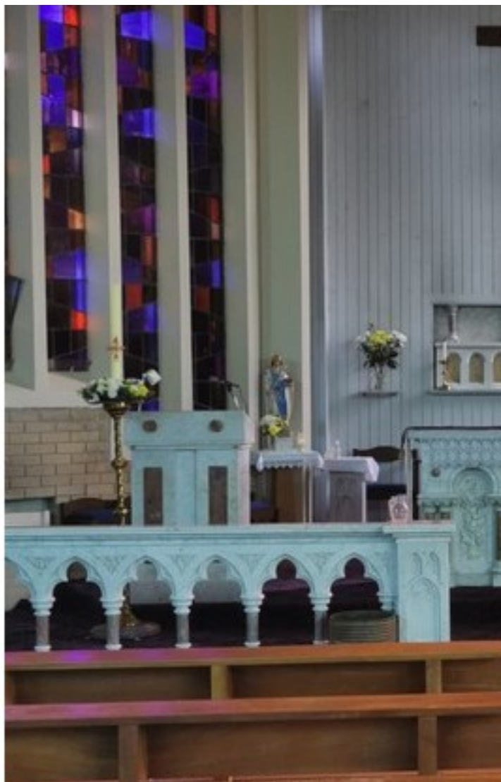
Jesus, truly present in the tabernacle, awaits . . .